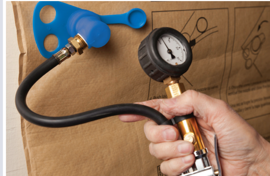
Use pressure gauge when filling. Use tool model 2910-6983-HD-KIT.