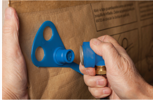
Attach quick-connect lock-ring tip to filler valve.